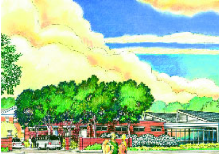
Adelphi University Garden City, NY

15,000 SF Facilities Management & Arts Building