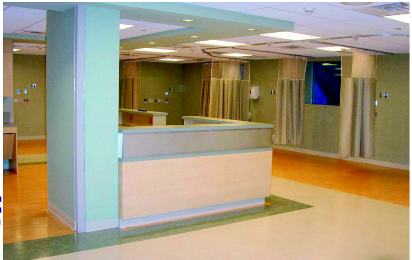
PBI Regional Medical Center Passaic, NJ 10,000 SF Cancer Center