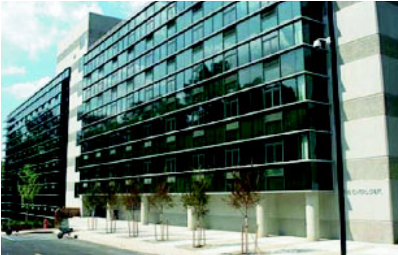
Ramapo College of NJ Mahwah, NJ